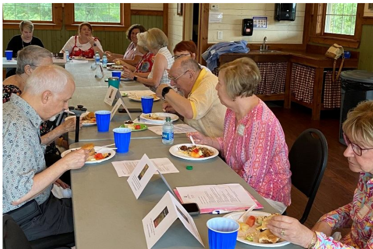
Friends enjoy social time at our luncheon and quarterly meeting at Choestoe School.